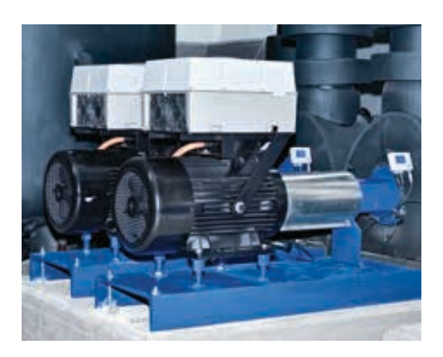
2 Etanorm PumpDrive pumps for continuous operation with high-efficiency KSB SuPremE<sup>®</sup> IE5 motors*