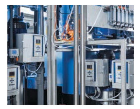
Movitec pumps with PumpDrive and PumpMeter