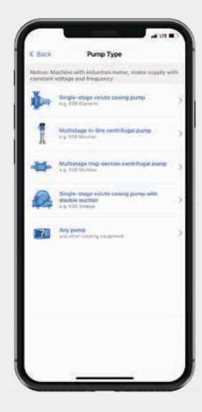
Step 2 Select your pump type.