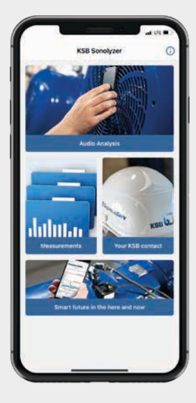
Step 1 Download KSB Sonolyzer® free of charge.

All of the above is made possible by a specially developed algorithm that is unique in the world and only offered by KSB Sonolyzer®.