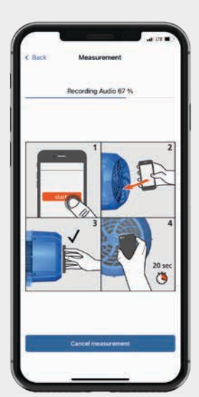
Start the measurement and hold your smartphone next to the motor. The KSB app delivers the analysis result in just 20 seconds.