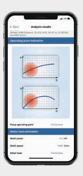
Step 5 The result of the measurement shows whether the operating point is inside or outside the part-load range.