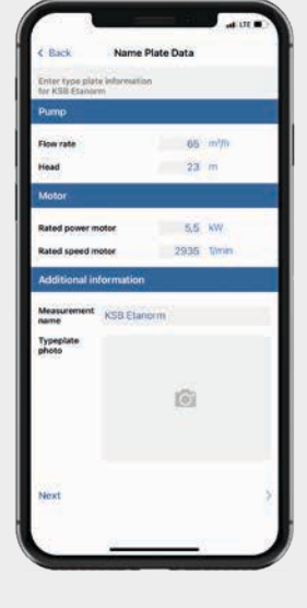
Step 3 Enter your pump and motor data.