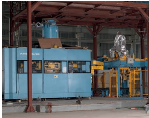
High Pressure moulding machine under commissioning