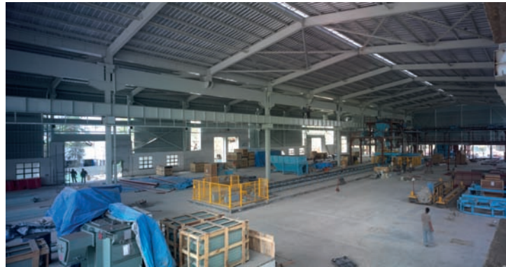
Inside view from Furnace side