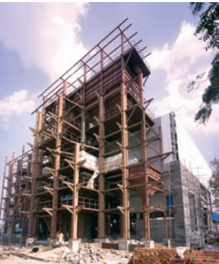
Ultramodern Sand Plant under construction