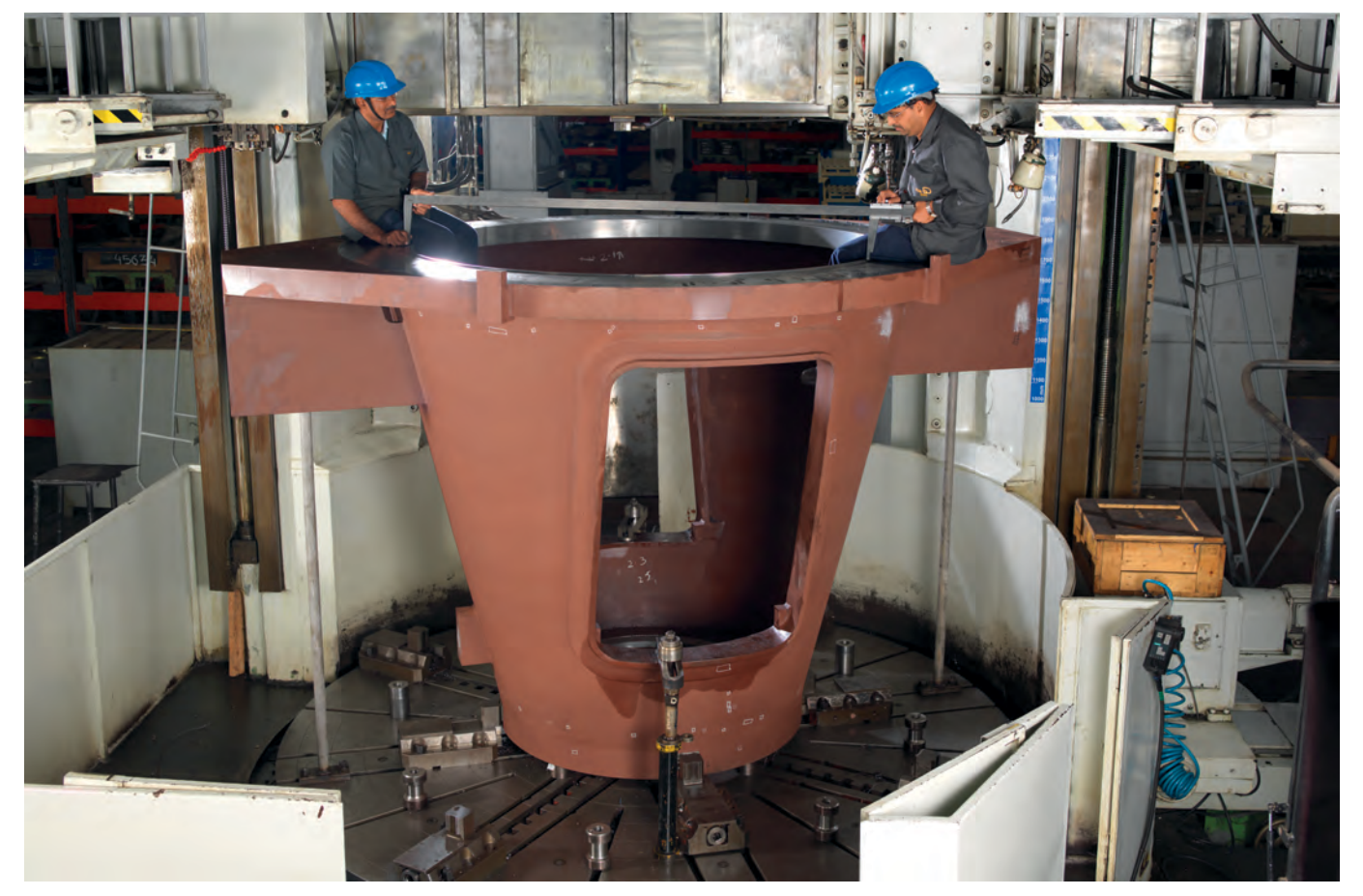
Machining of a giant motor stool of RSR pumps at Chinchwad works.