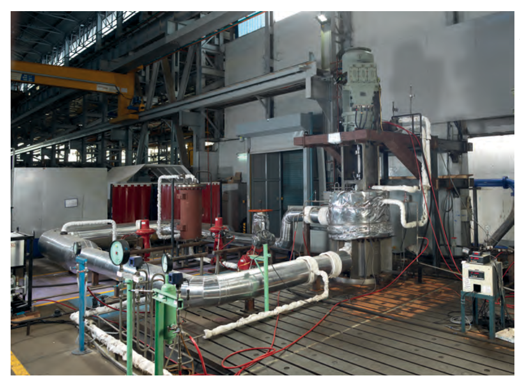
In April 2013, hot water testing for the Shut Down Cooling Pumps RVR 200-480 was successfully completed for 100 hrs. at Chinchwad works.