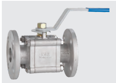
Two piece ball Valves flanged connection Three piece ball Valves threaded connection