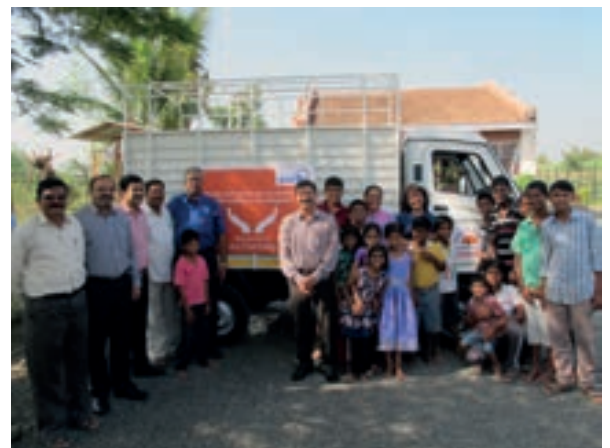
Maher Ashram, Pune - Provided a pick-up van for their Vatsalyadham project