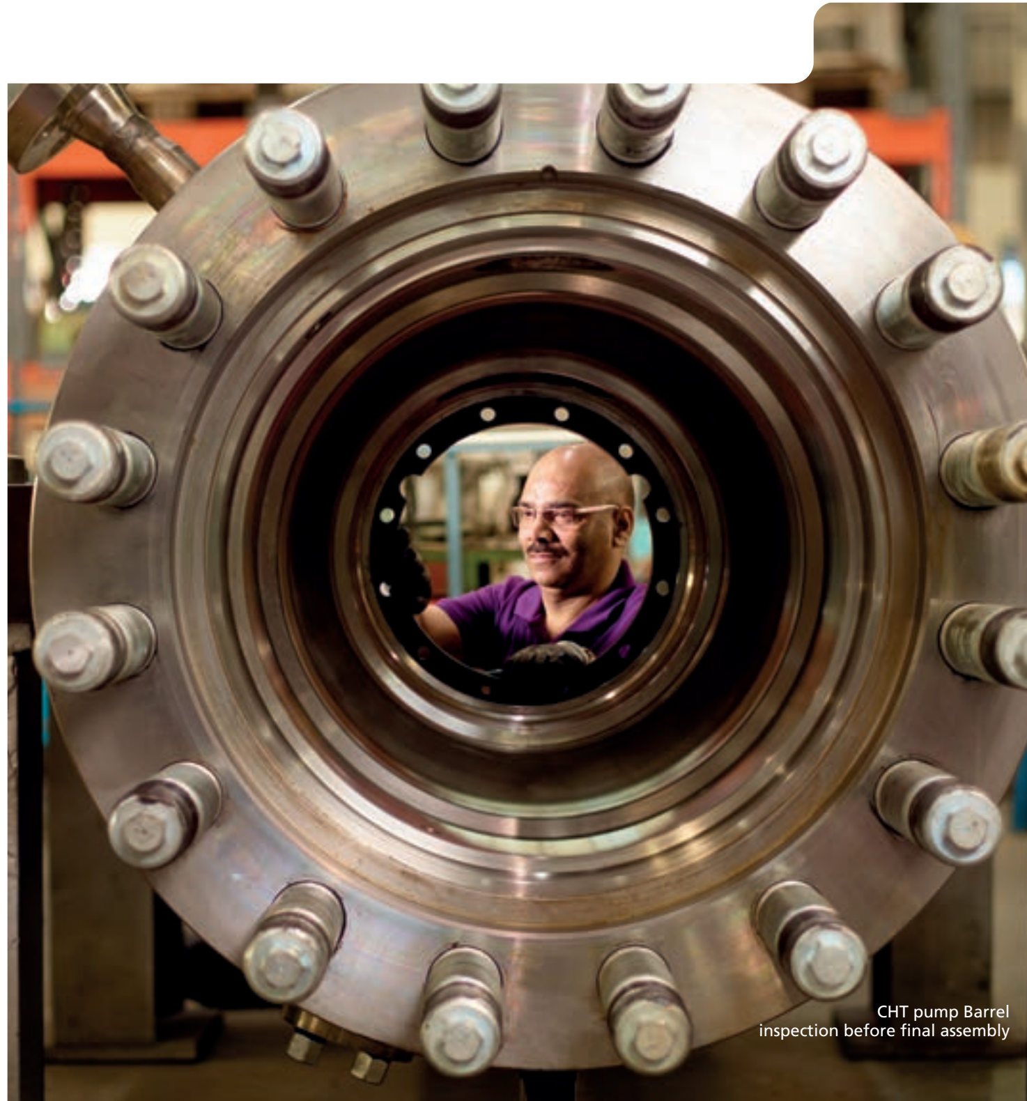
CHT pump Barrel inspection before final assembly