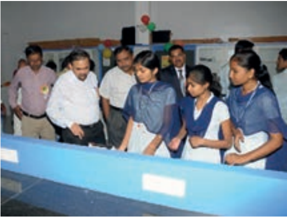
Mahatma Phule School, Sinnar - Provided instruments, chemicals, & furniture for laboratory