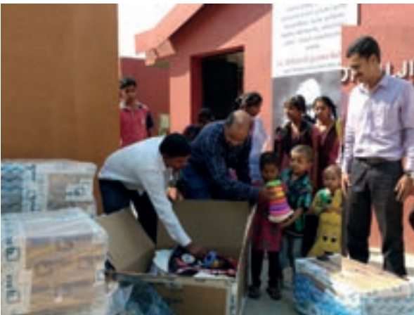
Snehalaya, Ahmednagar - Provided clothes and toys to underprivileged kids