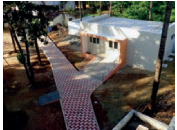
Families for the children - Campus 2, Coimbatore – Constructed a class room and a path way.