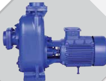
SPnorm & SPbloc