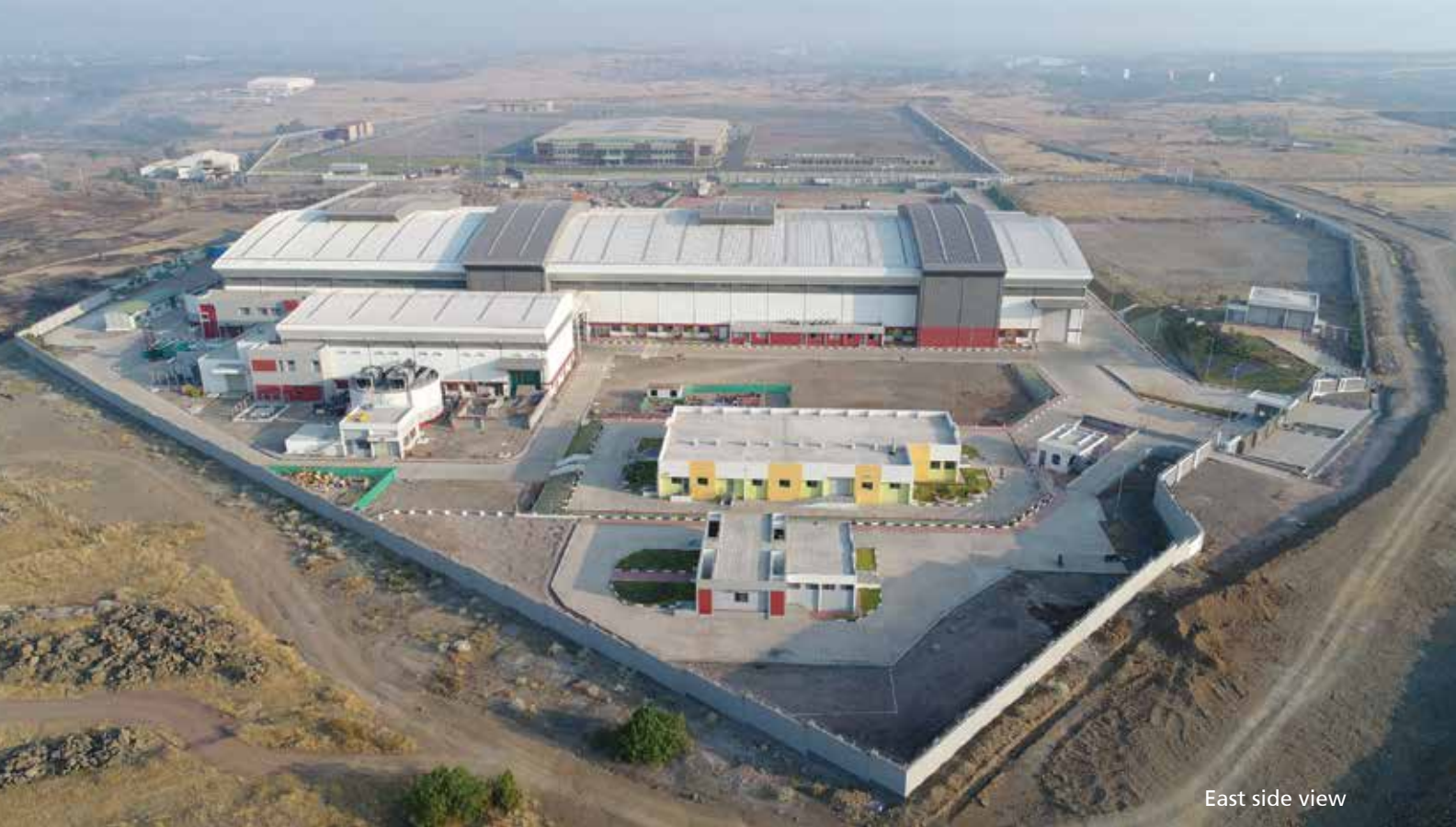
East side view