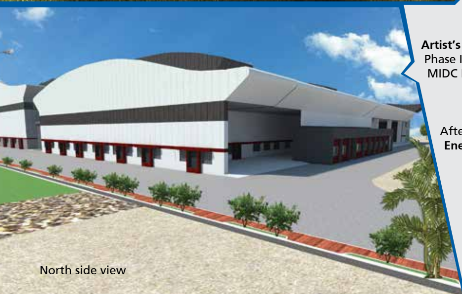
North side view

Artist's impression Phase II (Part 1) of Energy Pumps Division, MIDC Khandala, Satara.