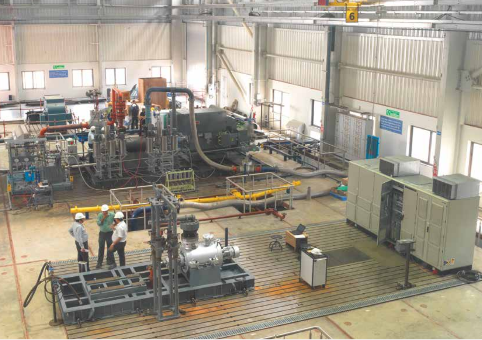
High pressure, multistage barrel casing pumps CHTR 5/9 with motor of 1300 kW were tested at Energy Pumps Division . These pumps will work as main pumps in one of the LPG pipeline projects in India.