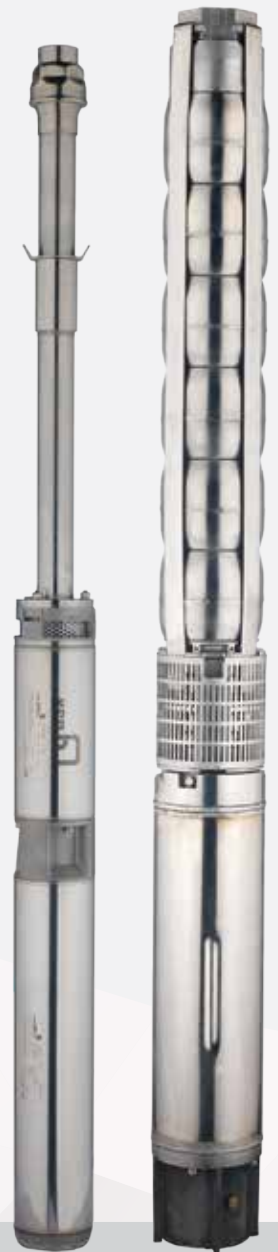
Stainless Steel Pumps for Solar applications