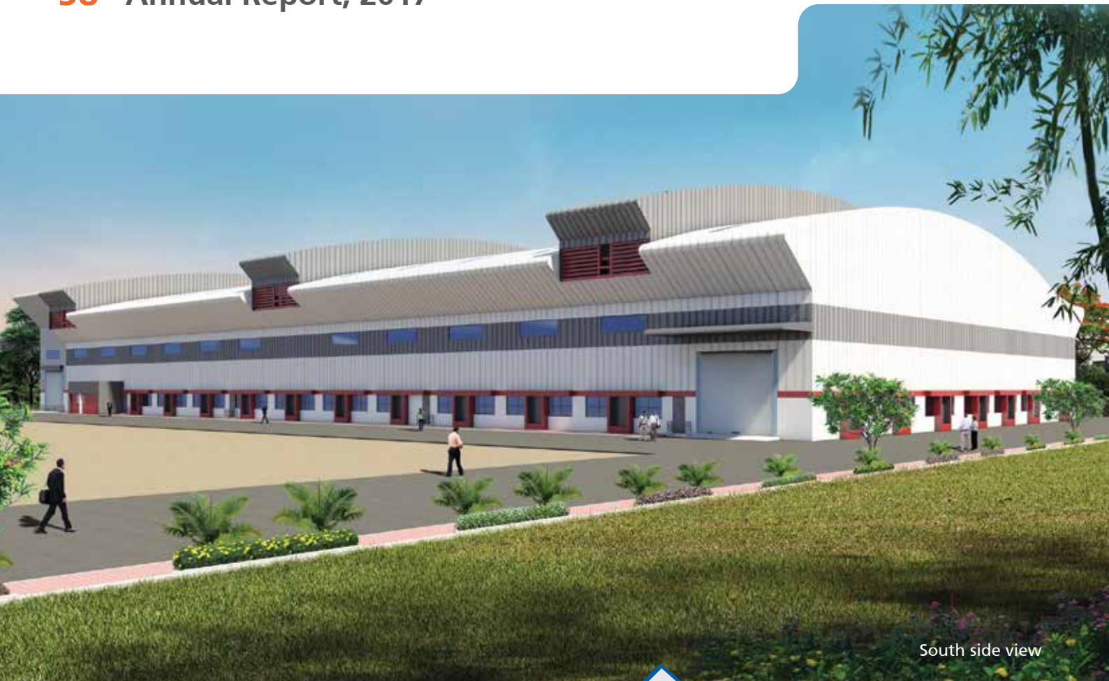
South side view