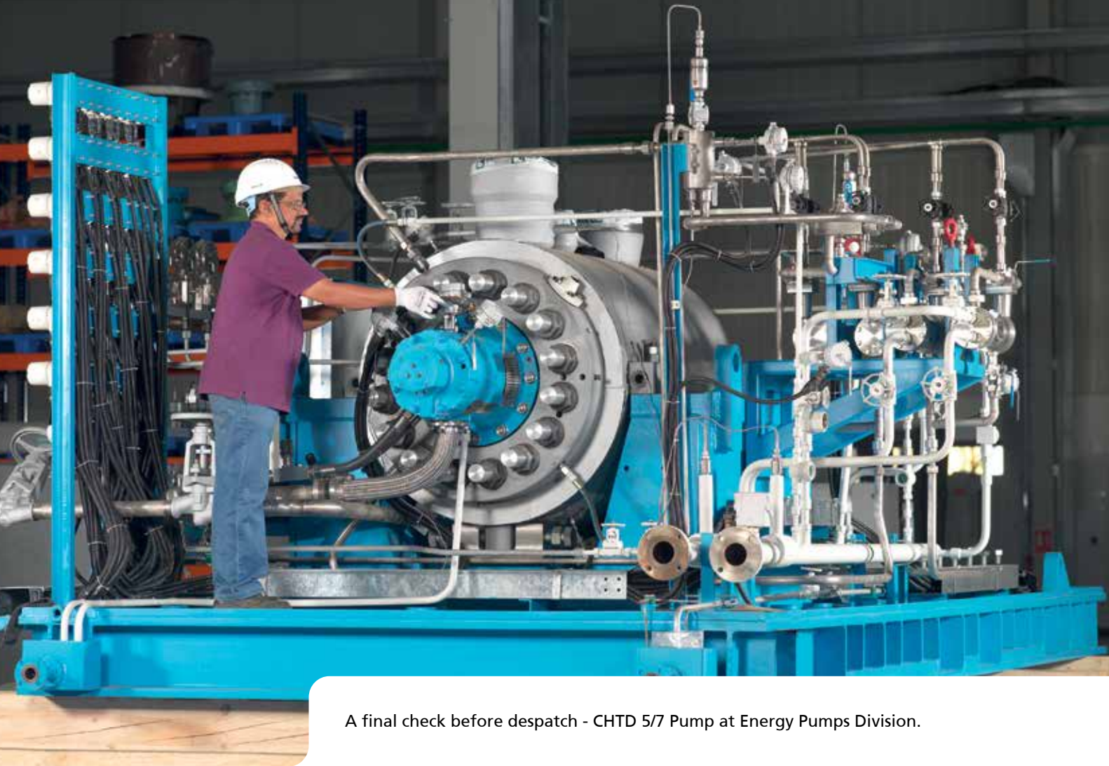
A final check before despatch - CHTD 5/7 Pump at Energy Pumps Division.