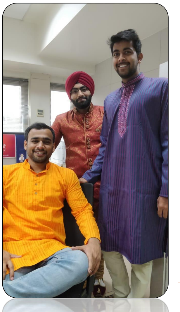
Traditional Wear Day