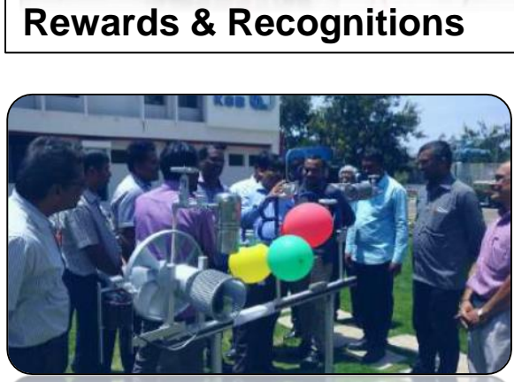
Engineer's Day Celebrations