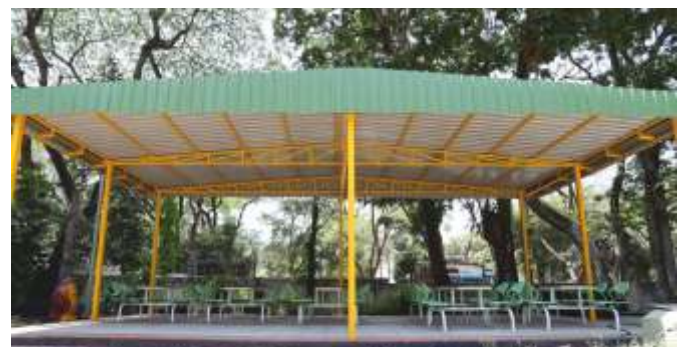
Bal Kalyan Sanstha - Construction of Dining area

Pumps and Valves are our business. Social welfare is our responsibility.