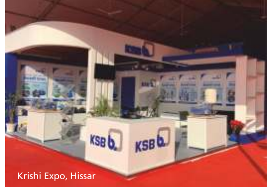
Krishi Expo, Hissar