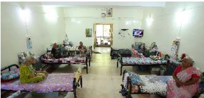
Niwara - Renovation of all dormitories and furniture replacement.