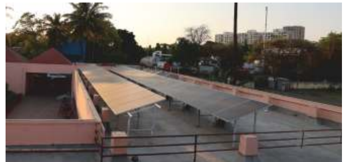
Mother Theresa Home - Installation of Solar Panels