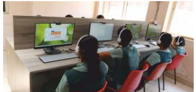
Bal Kalyan Sanstha - Computer room set up with computers & required softwares