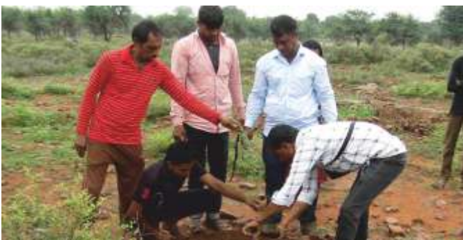
GrowTree.com - Donation for tree plantation